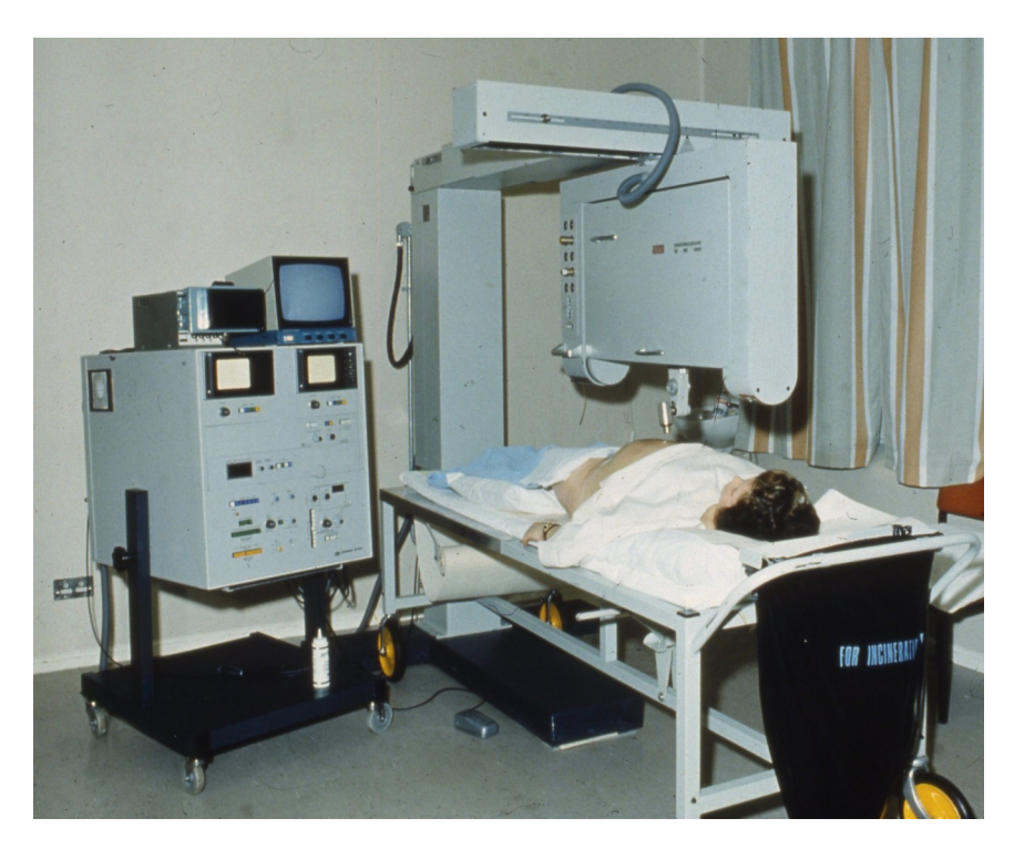
The Nuclear Enterprises Diasonograph. C. 1975

and image processing, compound scanning became less important. By the end of the 1960s, most large hospitals were equipped with a scanner of some sort. Some attempts to automate the scan were made, most successfully in the Octoson , developed by the Commonwealth Acoustics Laboratory in Sydney.